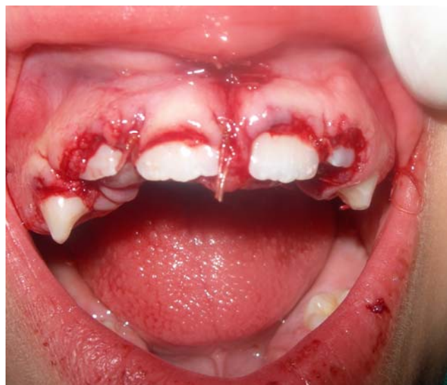
Figure 4. Gingivectomy.