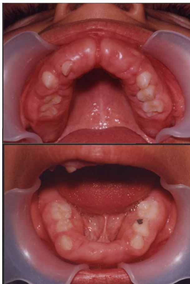
Figure 2. Massive gingival hyperplasia covering all the maxillary and mandibular teeth. Note the pale pink.

patient was referred for an intelligence quotient (IQ) test. The patient's IQ score was in the normal range. This syndrome should be differentiated from other condition with gingival enlargement in children like, drug induced, hereditary and systemic related gingival enlargement. The diagnosis of this case was based on patient history, clinical finding, systemic evaluation, and consultation with a pediatric specialist.